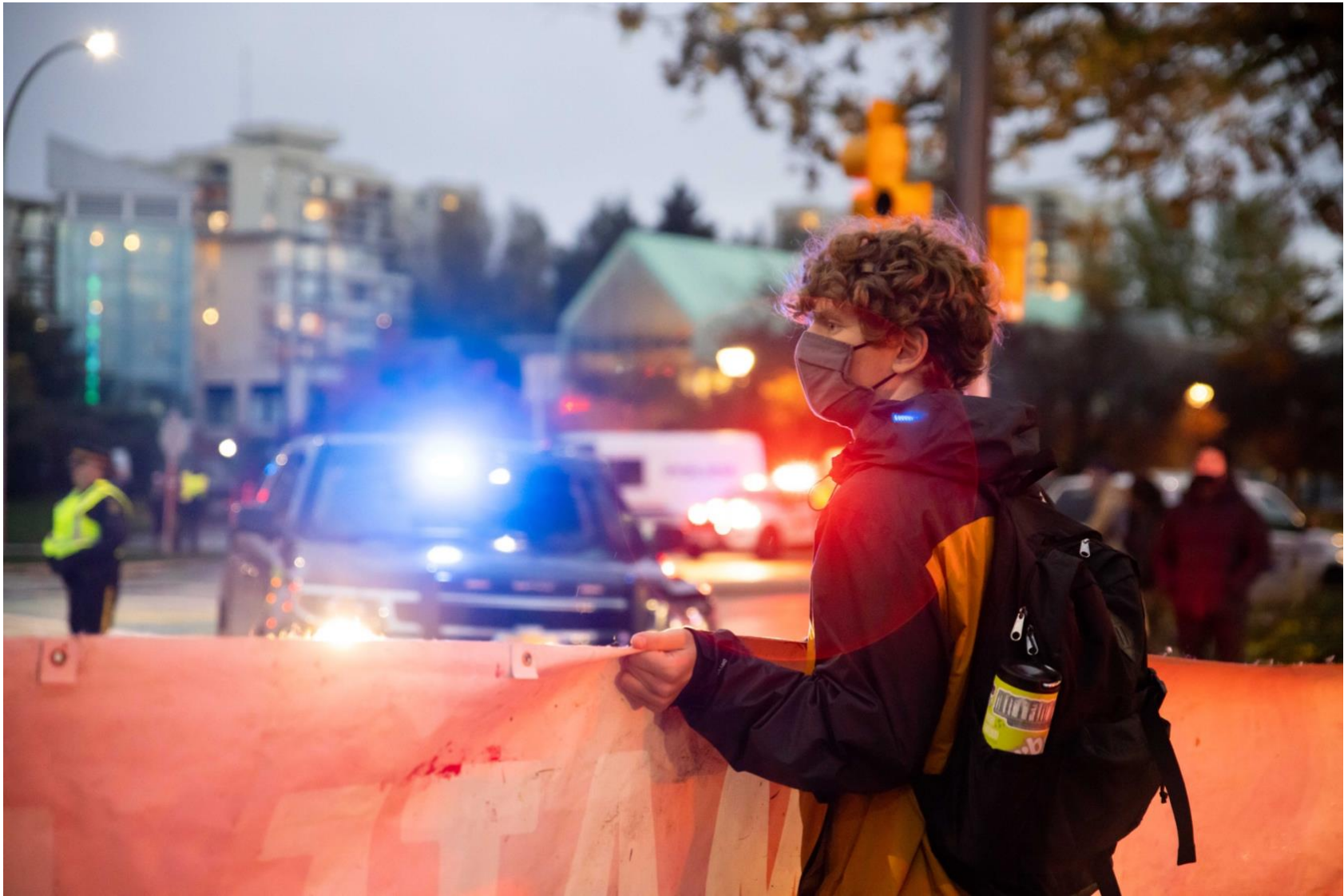
A protestor holds up an Extinction Rebellion banner against the lights of an RCMP vehicle. The organization states that it relies on active civil disobedience rather than petitions to disrupt current political structures and raise awareness.