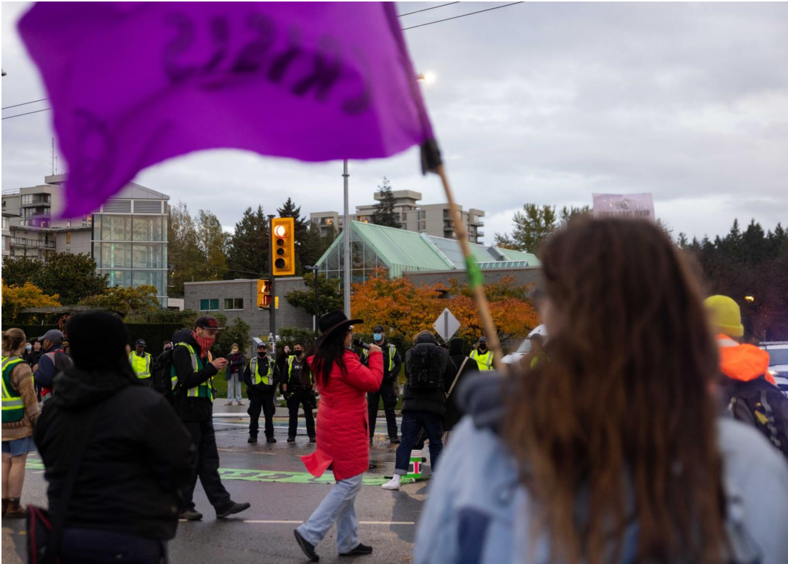
A Wet'suwet'en woman sings a song while framed against another protestor holding a climate crisis flag.