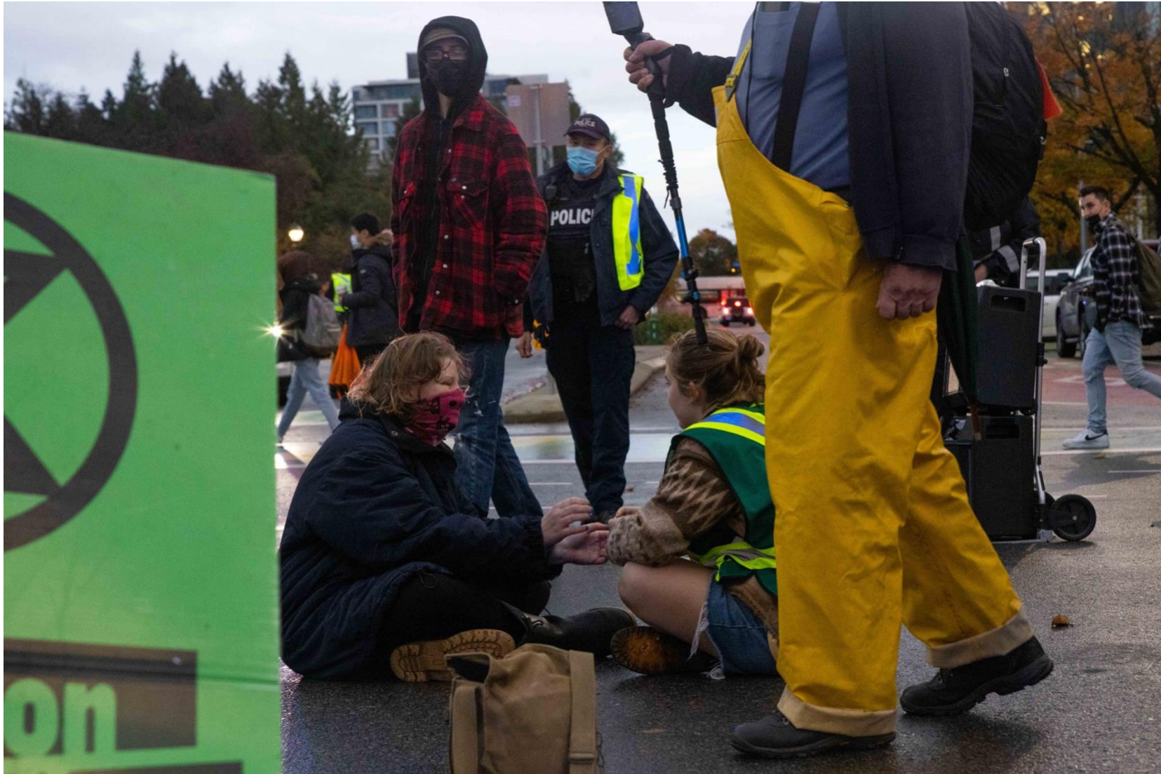
A pair of protestors share a quiet moment amidst RCMP officers' repeated requests to clear the intersection. Two protestors were eventually arrested.