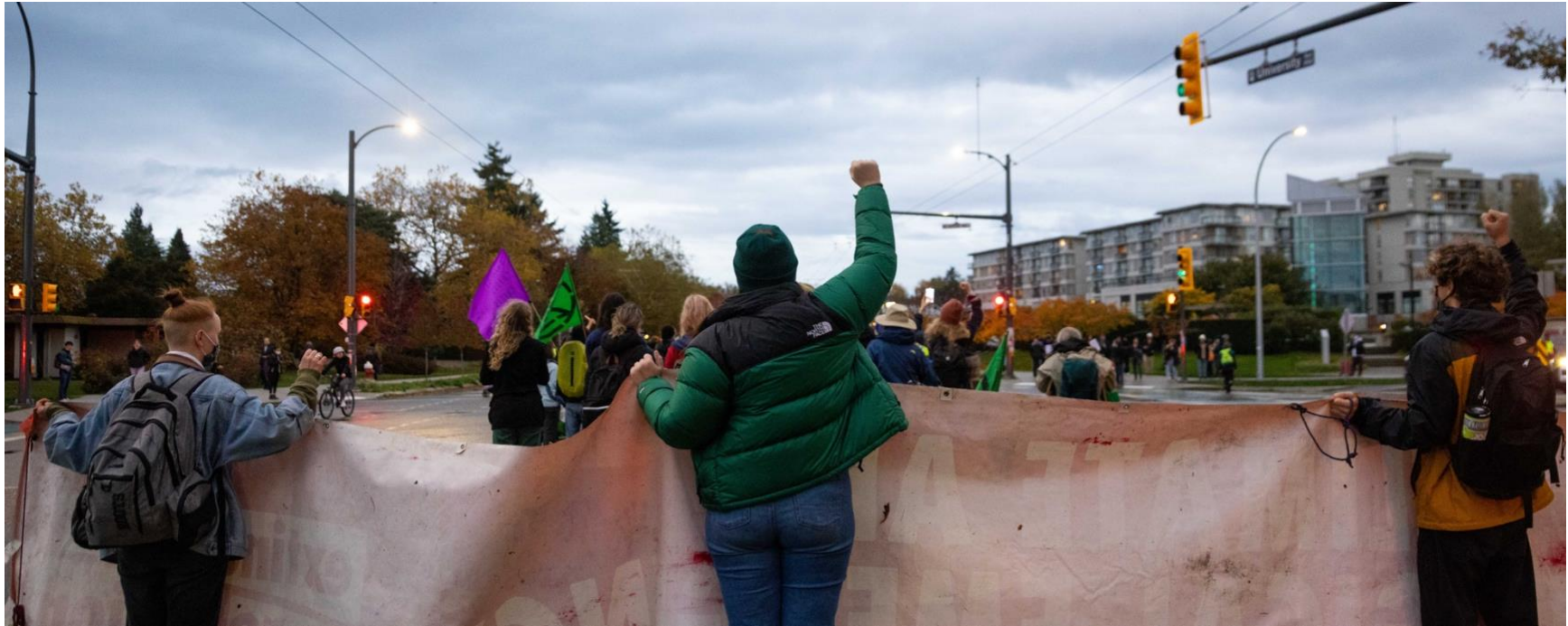
Three protestors raise their fists in solidarity against the RCMP, blocking off the main intersection leading onto campus. Another protest at UBC was planned for the same time the following day.