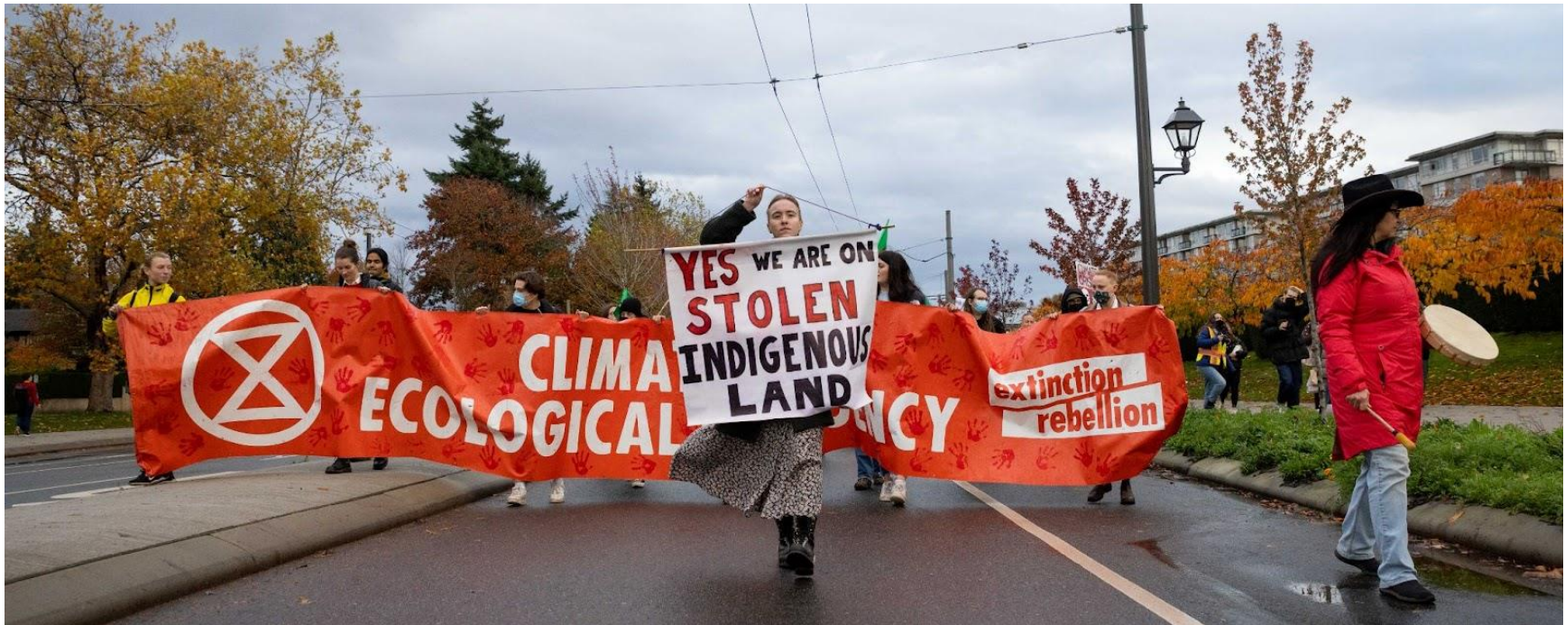
Extinction Rebellion protestors march down University Boulevard, one of the main and only roads that connects UBC's campus to the Greater Vancouver area. Roughly 40 people joined the protest, demanding land back to Indigenous peoples and that the university divest from fossil fuels sooner than its 2030 deadline.